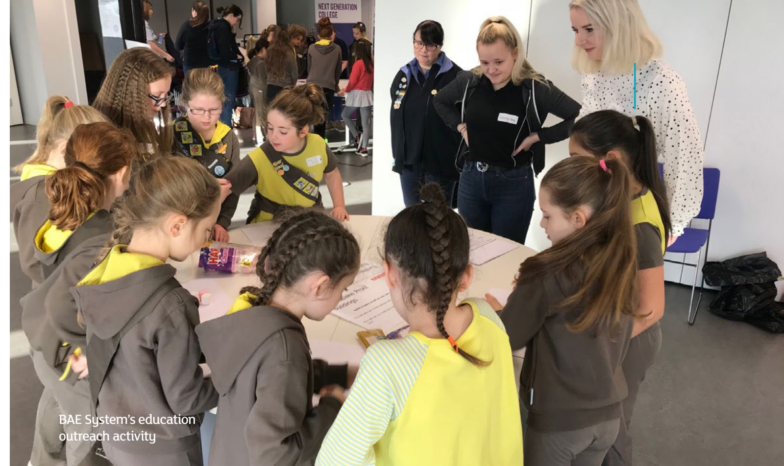
BAE System's education outreach activity

We believe that embedding equality within our commissioning has been a key driver of the proactive steps now being taken by learning providers to support apprenticeship employers to recruit more diversely. We are beginning to identify incremental improvements in representation across our provider network which is culminating in the improvements seen in the national statistics.