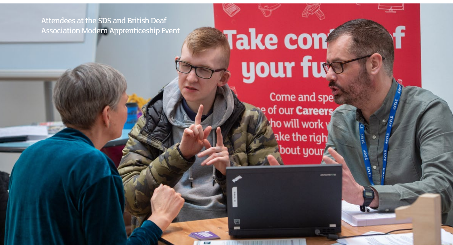
Attendees at the SDS and British Deaf Association Modern Apprenticeship Event